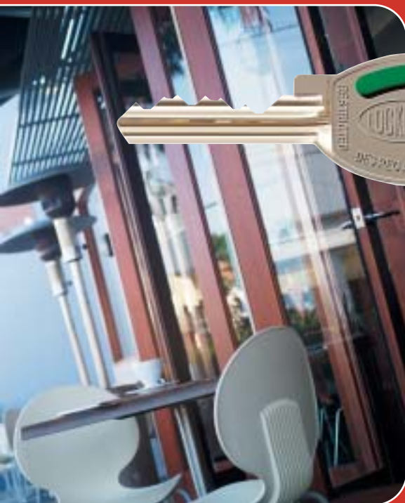
Stylish, convenient and flexible